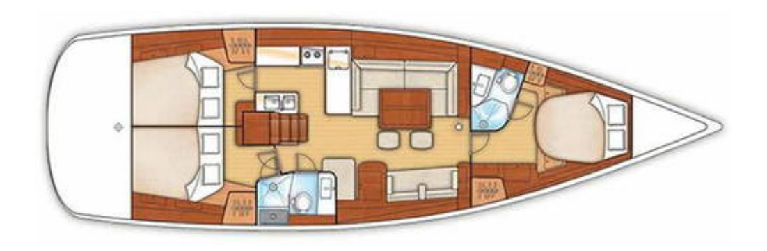
Network Yacht Brokers