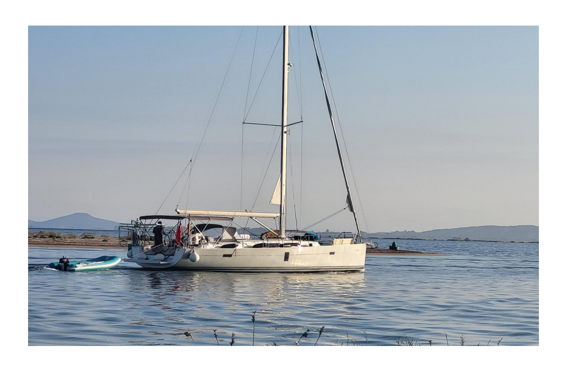
HANSE 445 3 Cabin layout