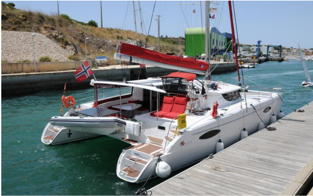
Fountaine Pajot Orana 44 Maestro Version